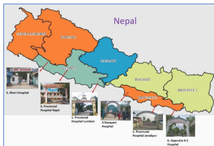
Figure 1 Six federal and provincial hospitals of Madhesh Pradesh and Lumbini Pradesh

Two provincial hospitals - Provincial Hospital Lumbini and Provincial Hospital Janakpur were identified for focussed support and four other hospitals- Bheri Hospital and Provincial Hospital at Rapti from Lumbini Province, and Narayani Hospital and Gajendra Narayan Singh Hospital from Madhesh Province were selected for supporting the FWD and NHTC to assess their potential for strengthening/expanding services. Except Rapti Provincial hospital, all other hospitals were existing SBA training sites, whereas Bheri Hospital and Janakpur Provincial Hospital were also FP training sites.