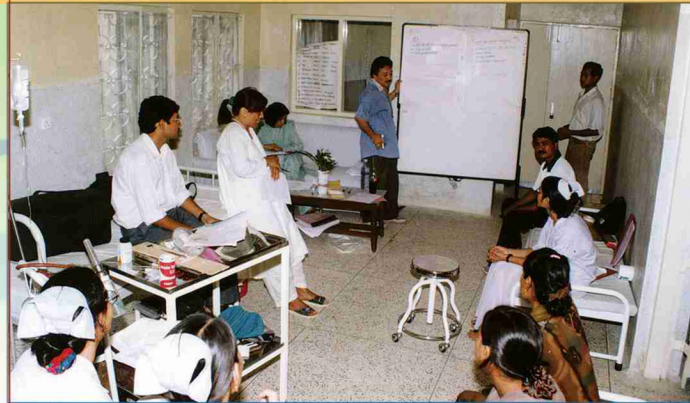
Human Resource Development