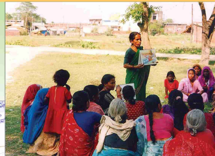
Behaviour Change Communications

The concept behind providing technical assistance is to strengthen Nepal's health system by building sustainable local capacity to deliver essential services and improve governance and leadership. It also includes improving the effectiveness of aid to the health sector. Long term technical assistance is provided in key strategic areas, supported by short term technical assistance, as needed.