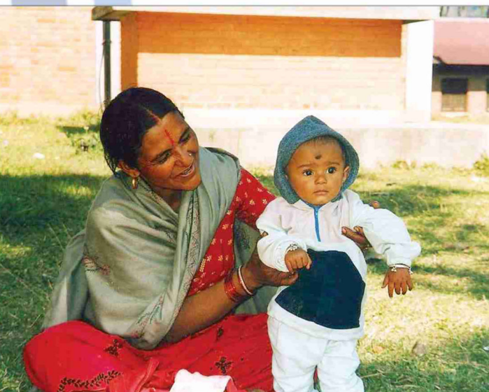
Maternal and Child Health