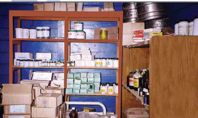
Supply of Essential Drugs