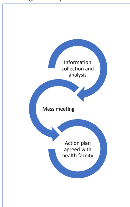
Figure 3: Key steps in social auditing

The social audit process included an analysis of health records, observation of the physical standard of the health facility, data on human and input resourcing, and perceptions of service users and underserved community groups. The social auditor analysed the various pieces of evidence and presented them to the HFOMC and health staff and together they drafted an action plan to address gaps. The findings were presented to the public at a mass meeting for validation and discussion and led to revisions in the action plan. Following the mass meeting, the social auditor finalised the action plan with the health facility staff and shared it with the HFOMC and the DHO. Progress was monitored through annual follow-up visits by the social auditor, who presented progress at a mass meeting with the community and updated the action plan.